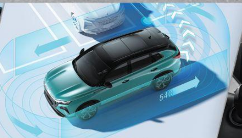
540° VEHICLE VIEW