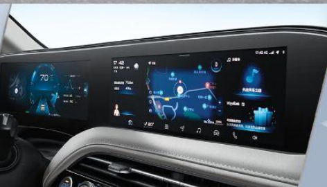
12.3" HD CONTROL SCREEN