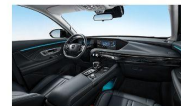
Vast Ocean Star